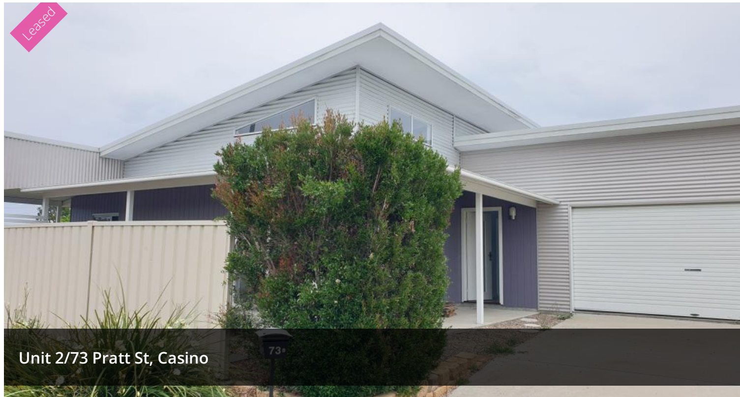
Unit 2/73 Pratt St, Casino