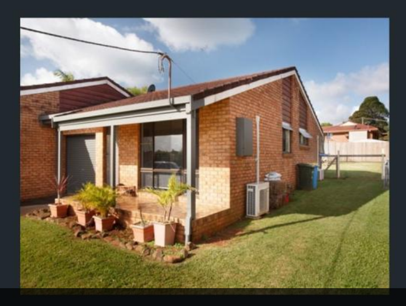
Unit 2, 8 Arrowsmith Ave, Alstonville